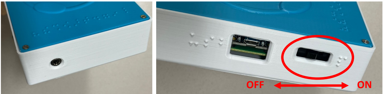
Figure 4: Audio jack and power switch

To hear the sonification, the LightSound must be connected to a headset or speaker.