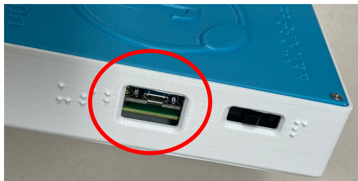
Figure 5: micro USB-B port (circled)